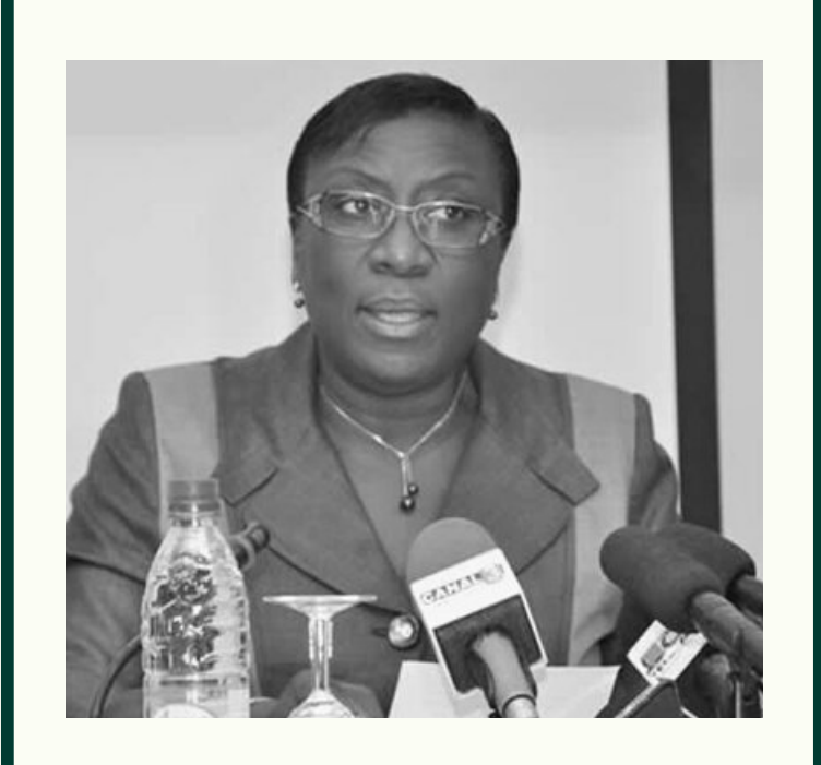
PR. DOROTHEE A. KINDE GAZARD Ex: Ministre de la santé de la République du Bénin

LA DIGITALISATION DES OUTILS: NOUVELLES APPROCHES DE LUTTE CONTRE LE PALUDISME ET LES MALADIES TROPICALES NÉGLIGÉES